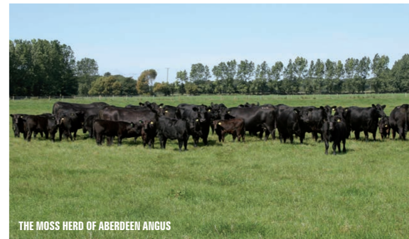
THE MOSS HERD OF ABERDEEN ANGUS